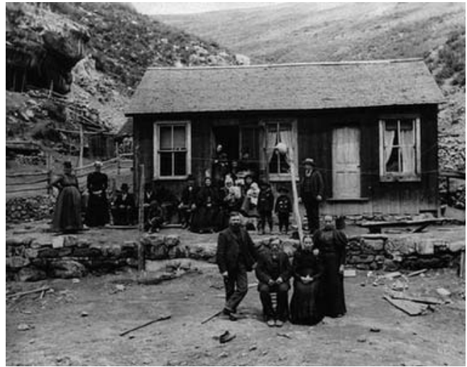
A group of Finnish Americans pose for a photograph in Scofield, Utah.