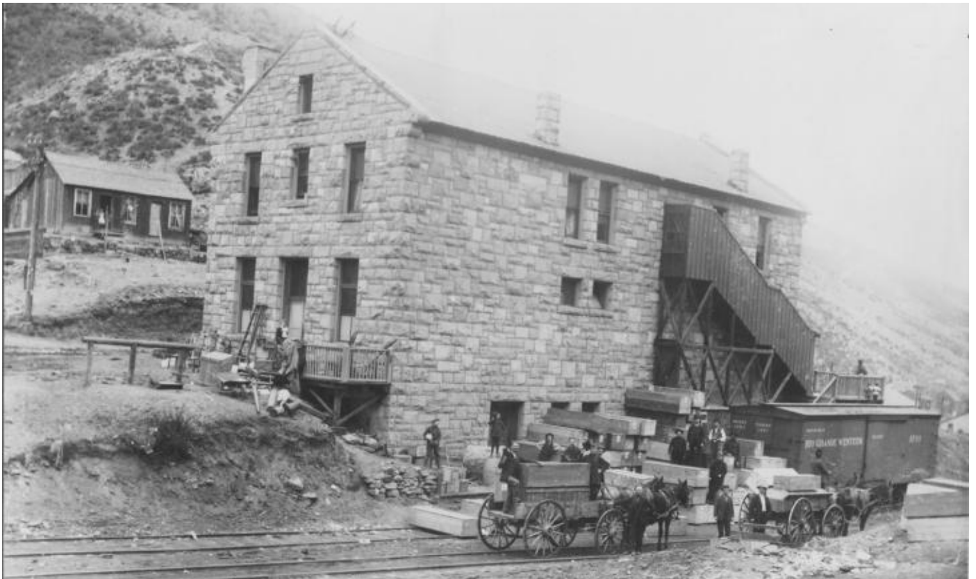
Workers prepare coffins for transport at the Scofield Wasatch Store in May 1900.