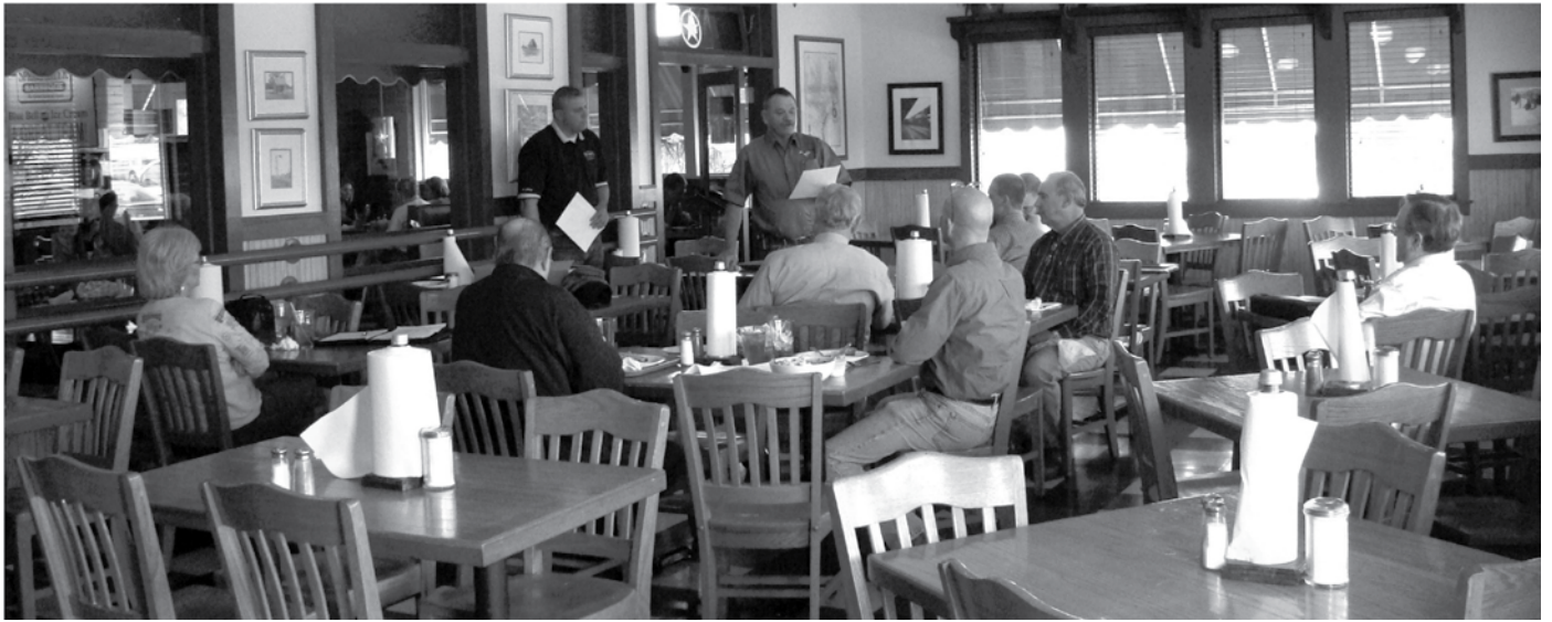
North Central Texas Holmes Council had a much smaller group than the “usual average of 30 attendees.”