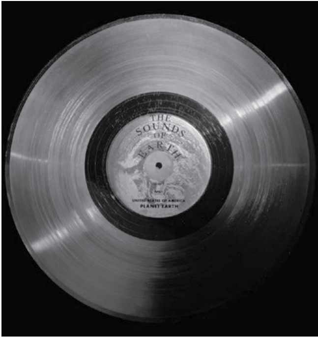
One of two golden discs launched in the early 1970s now traveling through interstellar space on one of the Voyager spacecraft.

Gold resists oxygen, heat, moisture, and most corrosive agents better than most any metal. The same properties that make gold perfect for jewelry make it perfect for extreme electronics.