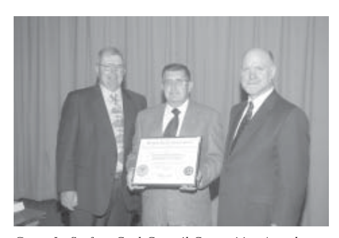
Group I - Surface Coal-Council Competition Award given to Powder River Basin District Council