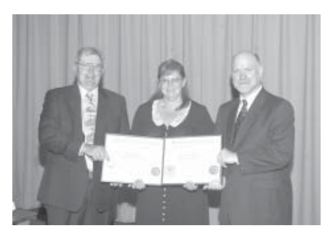
Group II - Surface Coal (Contractors) and Group III - Surface Coal (Contractors) Council Competition Award given to the Clearfield District Council