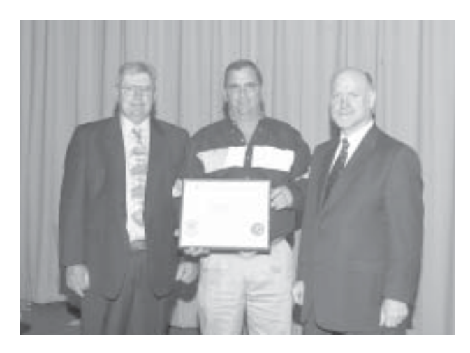
Group I - Surface MNM Council Competition Award given to the Hill Country District Council