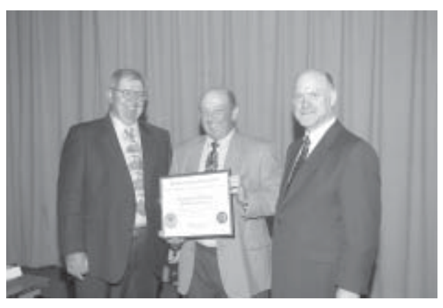
Group III - Underground Coal and Surface Coal Council Competition Award given to the Anthracite Division Council