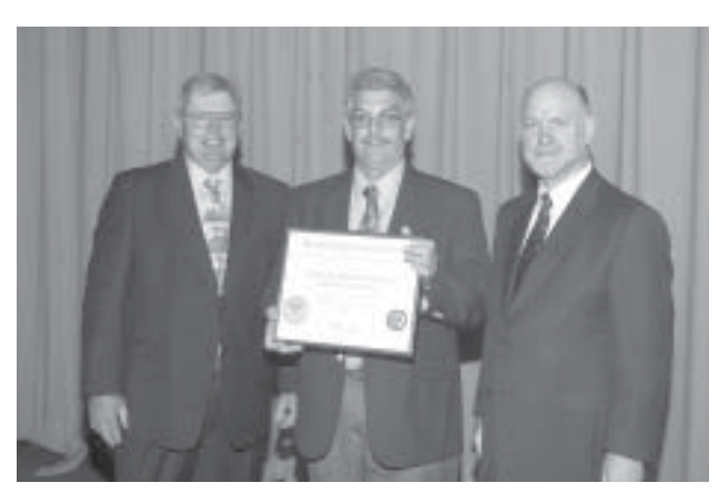
Group III - Surface MNM -Council Competition Award given to Natural Building Stone District Council