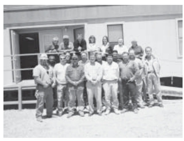
Attendees of the Part 46/Part 47 Workshop