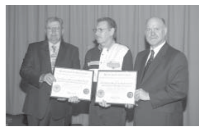
Group II - Underground MNM and Group III - Surface MNM (Contractors) - Council Competition Award given to Southeast Missouri Mine Safety Association District