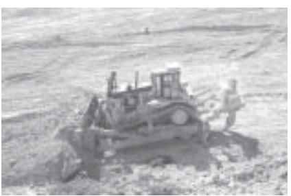
Jimmy Tom escaped serious life threatening injuries when the dozer he was operating rolled off the edge and dropped 26 feet down the slope.