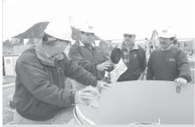
Tilcon Officials discussing the Training Facility

On November 6, 2003, the new Safety & Hazard Awareness Training Center, located at Tilcon's Mt. Hope facility in northwest New Jersey, was unveiled to employees and invited guests who toured the freshly painted blue and red training facility (Tilcon's logo colors) which sits on a one-acre plot adjacent to Tilcon's New Jersey Safety Office and Training Center. Here's how the center came to be.