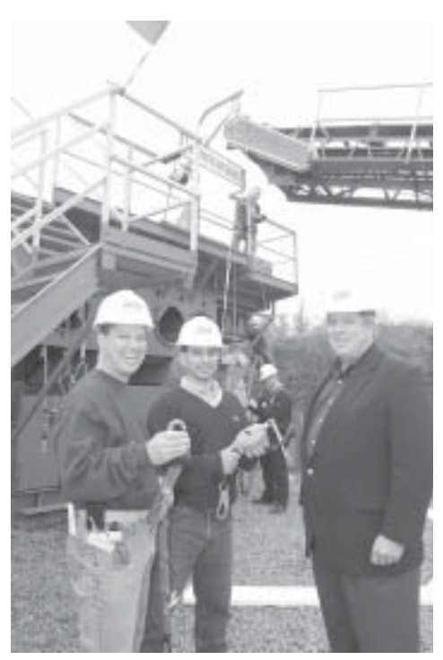
Participants checking out the fall protection gear

Training would take place at stations where miners could learn about topics such as: fall protection, confined space, trenching, fire extinguisher use, traffic patterns, and hoisting and crusher jams. These stations would illustrate many of the potential situations a miner could be exposed to in a plant environment.