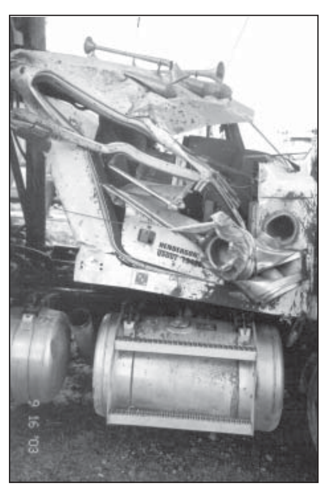
Arnold R. Petty escaped serious injury by wearing a seat belt while driving this truck loaded with ammonium nitrate.

A miner collided with five piles of red dog in a haul road while leaving a surface coal mine on November 22, 2003. He sustained back and hip injuries, but his seat belt prevented him from losing control of his vehicle.