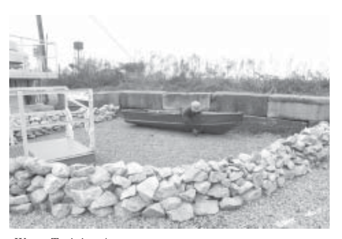
Water Training Area

For example, excess equipment and inventory destined for an auction sale was gathered from Tilcon's New Jersey and New York facilities and brought to the center. Equipment moved to the Mt. Hope site included: a radial stack conveyor (used to portray typical conveyor hazards), a crusher (used in crusher jam training), an asphalt bin system (used to teach confined space safety and fall protection), and a rowboat (used in a simulated water trainer).