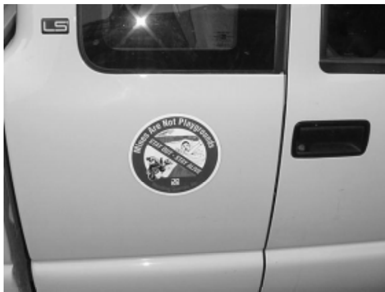
A magnet with the emblem like the SOSA sticker has been enlarged to approximately 10 inches in diameter and placed on several of the trucks to help remind anyone seeing the emblem of the hazards of abandoned mines for all ages trespassing on these properties.